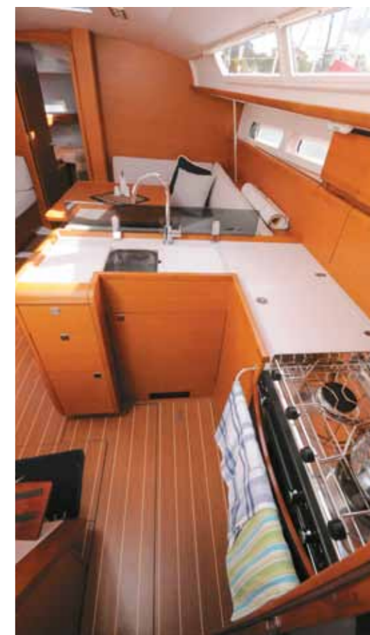
The forward cabin (top) is the same size on all three SO 409 variants, but on two-head models, the en suite fits between the bulkhead and vee-berth, otherwise it's clear space as per the test boat. The L-shaped galley (above) is ready to serve being immediately aft of the dinette.

Jeanneau's Briand Design team resisted the temptation to turn the new 40-footer into a 50-footer, or a catamaran-style entertainer, so the Sun Odyssey 409 doesn't exhibit a big, fat bum, high freeboard and lumpy coach house. The freeboard is there in sufficient height to give full headroom throughout the interior, but it's broken up by four longitudinal hull ports and slimming striping. A long, unbroken band of coach house glazing focuses the eye lengthways along the boat and the coach house sides are convex, so cabin height isn't accented.