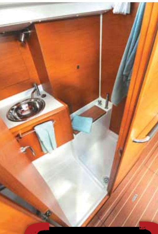
Aft cabins (above left) in three-cabin layouts have double berths and wardrobes. Saloon head (left) has a separate shower stall. In forward and aft cabins, hull ports (above photos) are covered by sliding shutters that disappear into recesses when not in use.

EASY DOCK ACCESS, MANOEUVRABILITY, THOUGHTFULLY LAID-OUT SAIL CONTROLS AND A SAFE COCKPIT TAKE MUCH OF THE WORRY OUT OF USING THE JEANNEAU SUN ODYSSEY 409