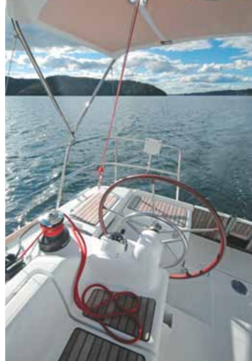
The swivelling GPS multifunction display (above left) on the cockpit table is included in the Navigation Pack option. Helm seats (above) face inward and forward. On three-cabin 409s, chairs flank a chart table opposite the U-shaped dinette (left).