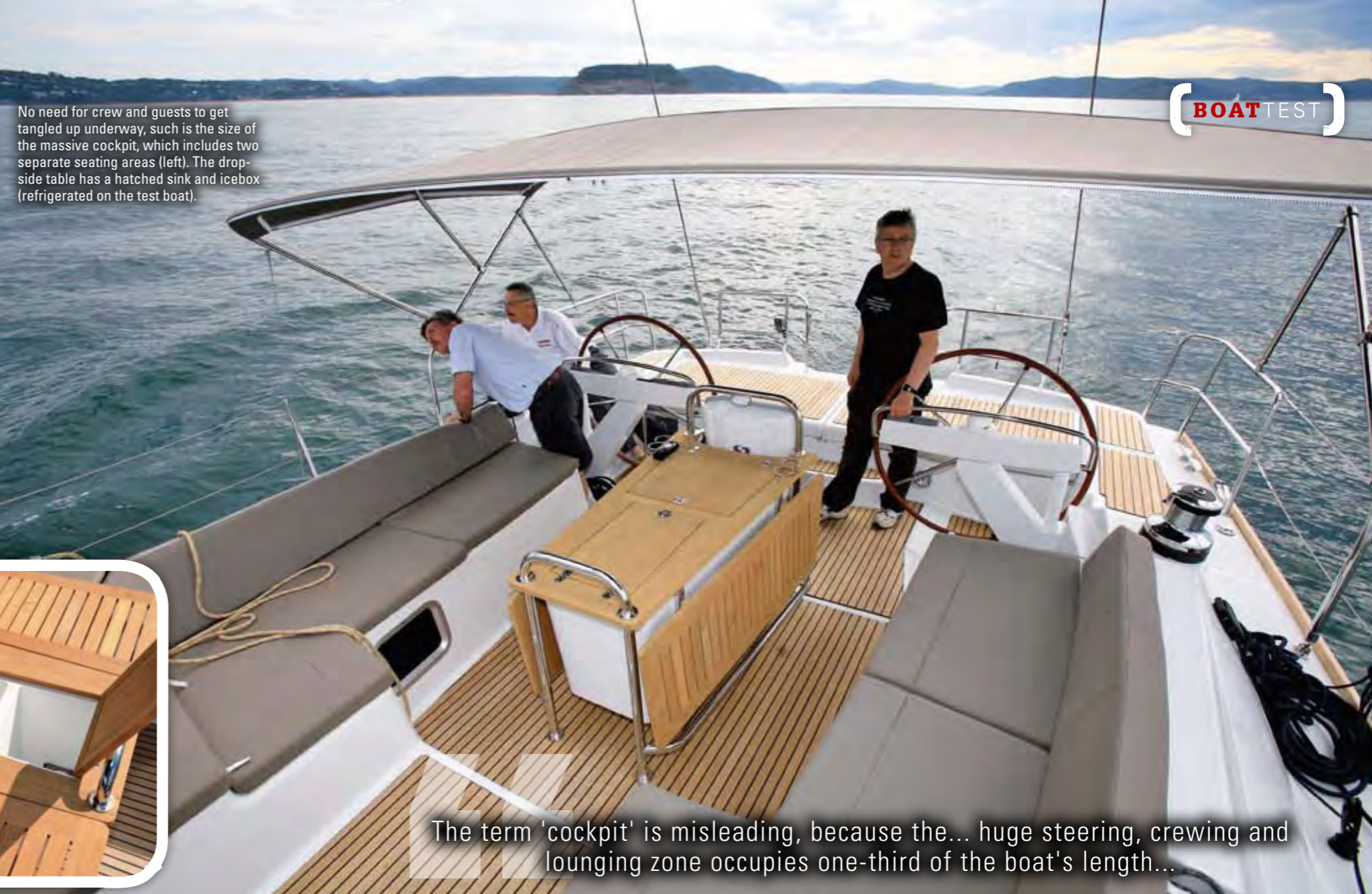
No need for crew and guests to get tangled up underway, such is the size of the massive cockpit, which includes two separate seating areas (left). The drop-side table has a hatched sink and icebox (refrigerated on the test boat).

M ost yacht owners are used to compromise when they "head down to the boat". They accept that they won't have homelike living space and they somewhat grudgingly leave behind the big-screen telly, the dishwasher, the washing machine and a host of other 240V appliances. Not so, in the case of the Jeanneau's 57: a true luxury home afloat.