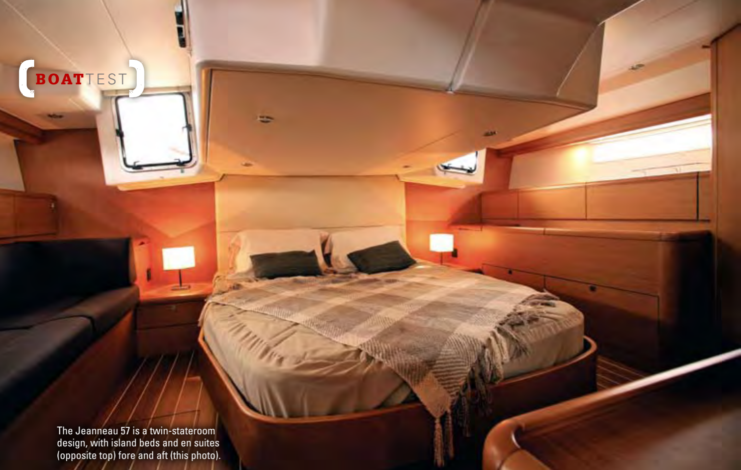
The Jeanneau 57 is a twin-stateroom design, with island beds and en suites (opposite top) fore and aft (this photo).