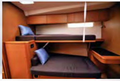
Transom drops to make a large teak-topped swim platform (opposite right) and to access the garage that's also accessible from a broad cockpit sole hatch (opposite above right). Fore cabin on the test yacht is setup with a queen bed (middle top) and two singles (above).