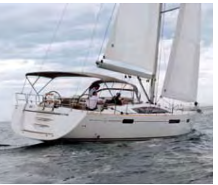
The big Jeanneau 57 is a fast, luxurious cruising yacht that's easy for two to handle, particularly with optional powered halyard and sheet winches (left).