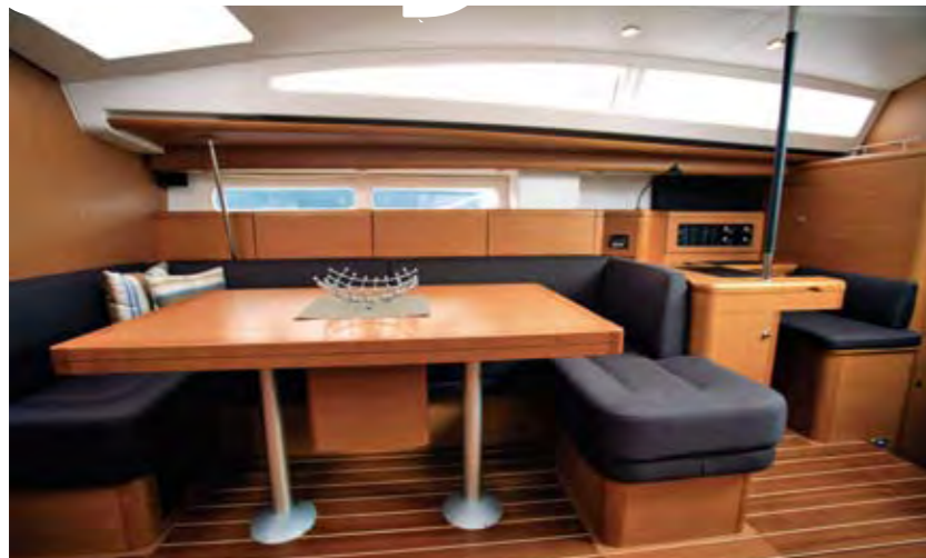
Nothing squeezey about this yacht's galley that features a top loading freezer, three-burner gimballed stove and oven, range hood, and optional dishwasher and microwave. Opposite is the dinette and table and the adjoining chart table where a washing machine can hide in the seat (below left).

fridge with bench top and front access, a top-loading freezer, three-burner, gimballed stove with oven, range hood, optional dishwasher and microwave.